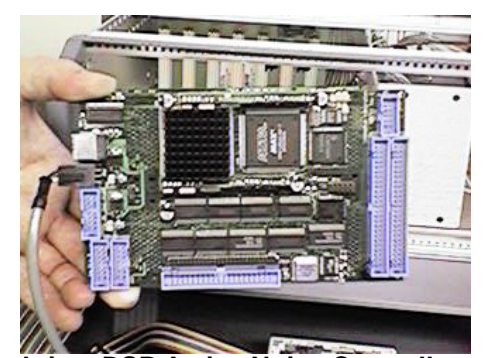
Real-time DSP Active Noise Controller with New Multichannel Adaptive Feedforward Control Algorithms